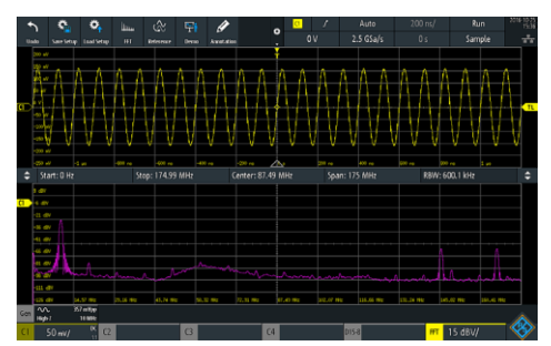
R&S ^{\circ} RTB2000: 10.1" display, 1280 \times 800 pixel resolution