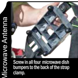
Screw in all four microwave dish bumpers to the back of the strap clamp.